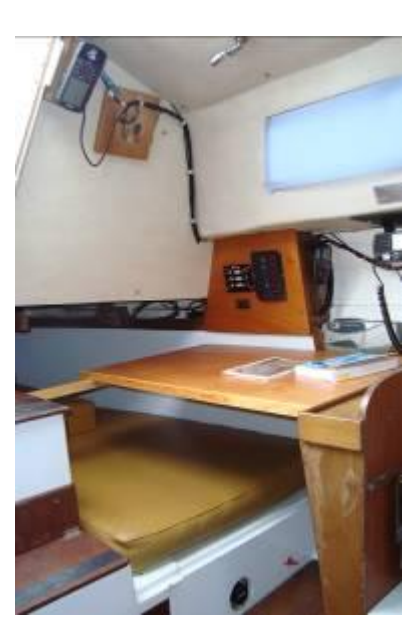
Nokomis, top left: engine bay, top right: chart table, left: cockpit reefing and instruments.