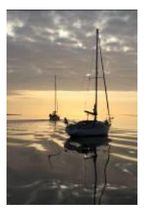
Varuna II passing Wi Hio